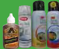
Glues and Adhesives