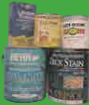
Oil-based Paints & Stains No latex