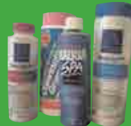
Pool & Spa Supplies