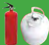
Fire Extinguishers or Propane Tanks 7.5 gallons or less