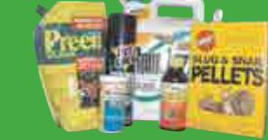
Lawn & Garden Products No professional grade