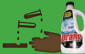
Corrosives Limit 1 gal. hydrofluoric acid mixtures