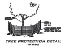
Tree Preservation Plan