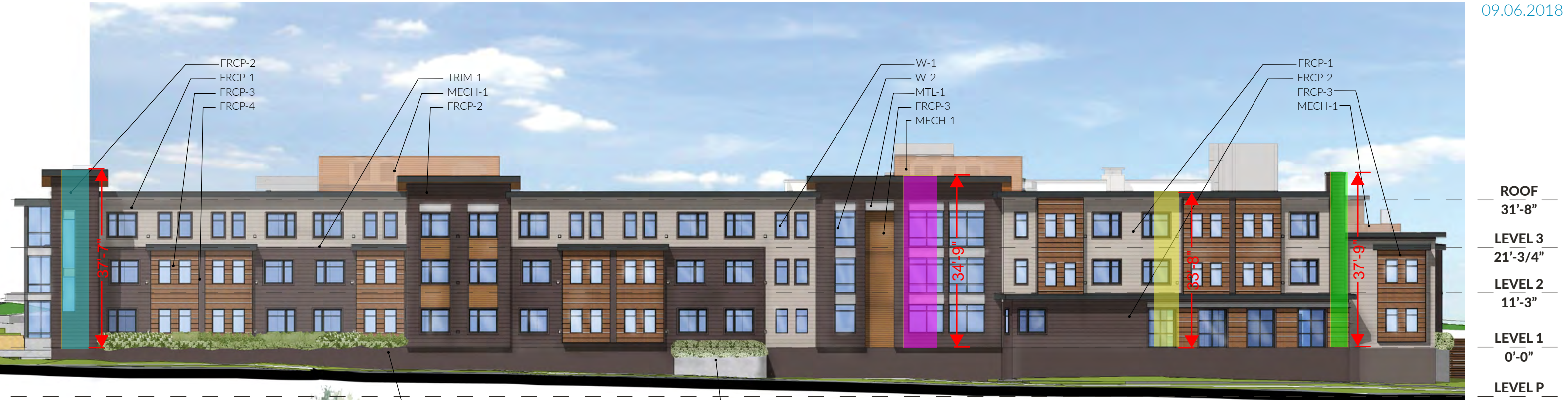
EAST ELEVATION SCALE: 1" = 20'-0"