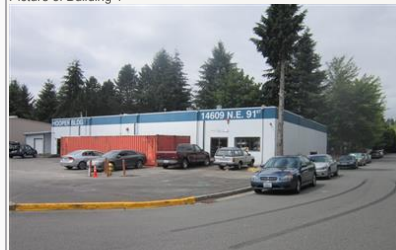
Picture of Building 1