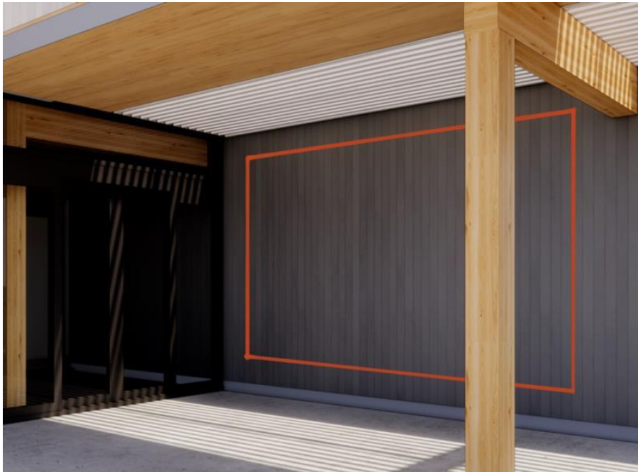
Senior Entrance 18 x 15'

The entrance artwork should be a welcoming beacon for senior visitors. Whether coming or going, seniors should be met with an artwork that proudly unites and celebrates them. This is an exterior site so durable material will be required.