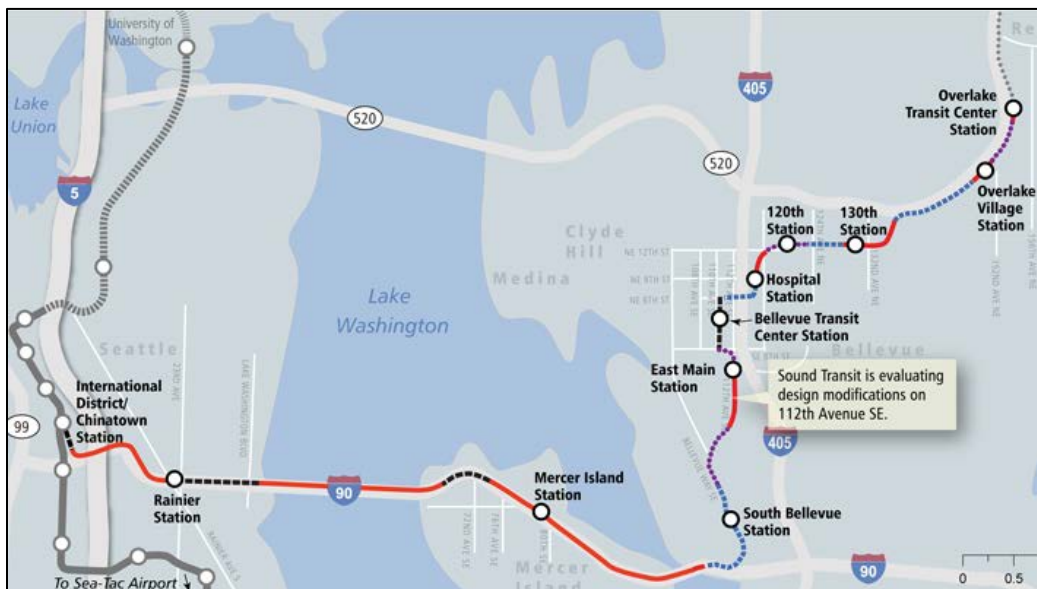
Figure 1. Sound Transit East Link

Final design for East Link has been divided into three contracts – I-90 Civil Design, South Bellevue to Overlake Transit Center (OTC) Civil Design and Systems Engineering for the entire length of the project. The South Bellevue to OTC Civil Design has been further divided into separate segments for construction purposes. The portion of East Link along SR 520 and the entire segment to be built in Redmond is segment E-360.